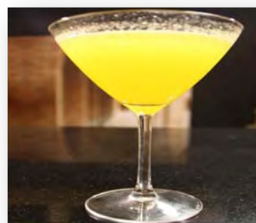
Fig 9: Squash

Serving: Add 1 tbsp of squash in 150 ml water and serve.