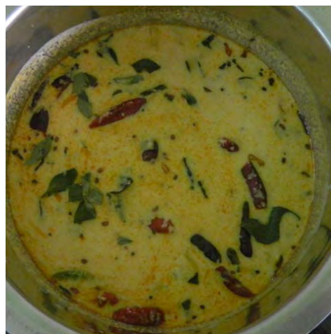
Fig 25: Pulissery