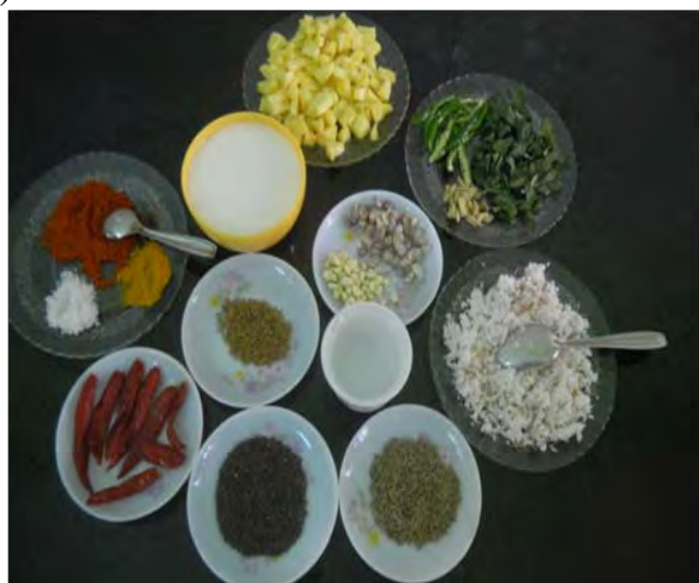
Fig. 24: Ingredients for Pulissery