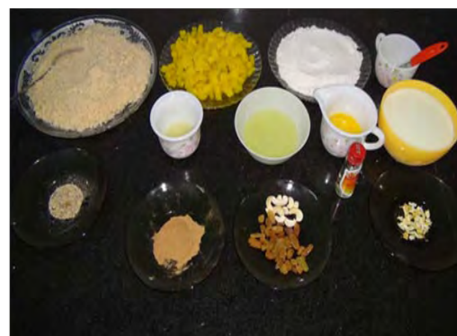
Fig 20: Ingredients for pudding