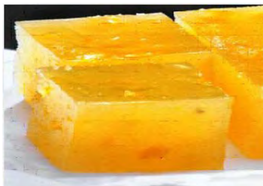
Fig 17: Halwa