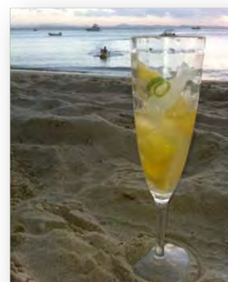
Fig 35: Pineapple Vodka