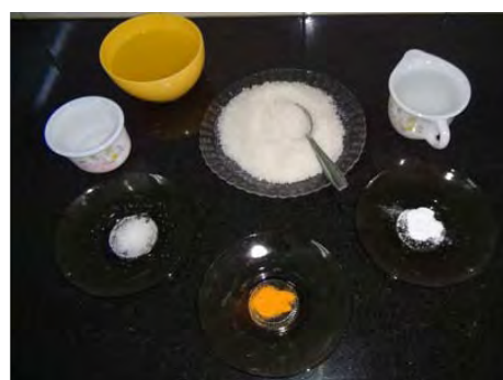
Fig 8: Ingredients for Squash