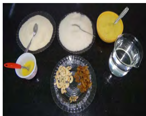
Fig 12: Ingredients for Kesari