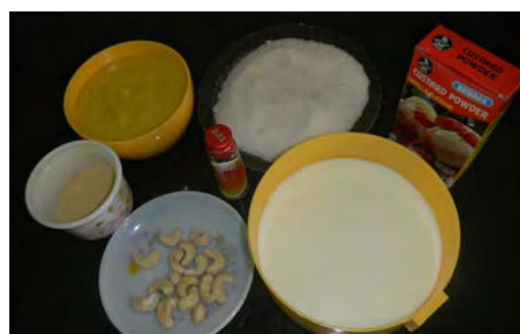
Fig 30: Ingredients for Ice-cream