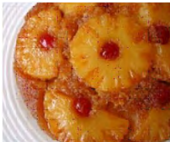
Fig 27: Upside down cake