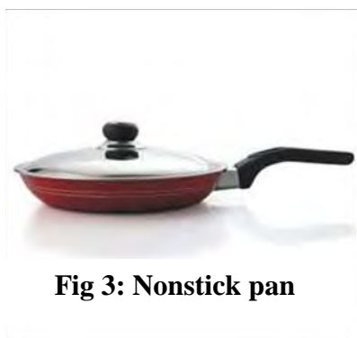
Fig 3: Nonstick pan