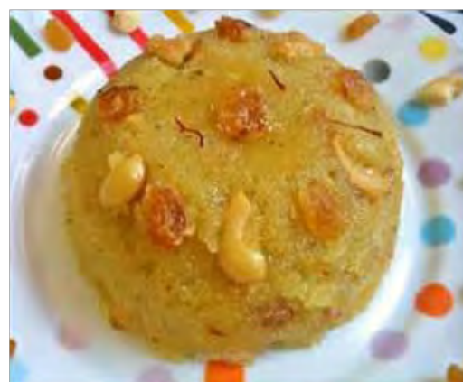
Fig 13: Kesari