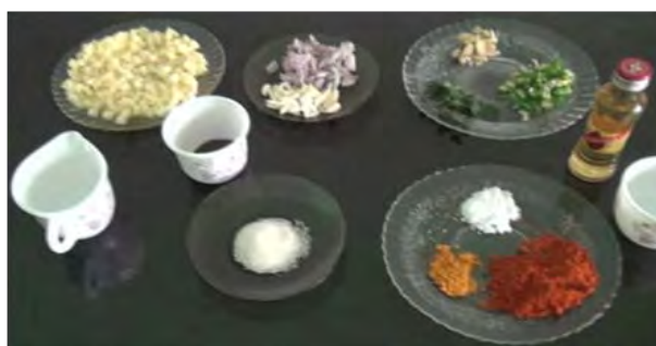
Fig 14: Ingredients for Pickle