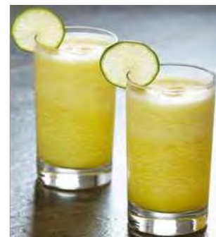
Fig 33: Pineapple lime