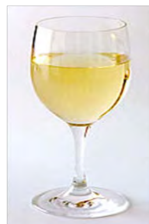
Fig 36: Wine