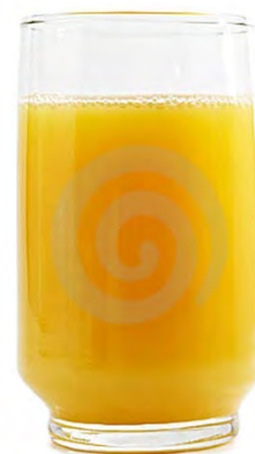
Fig 7: Pineapple juice concentrate