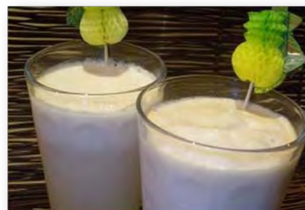
Fig34: Tropical Pineapple Colada Cocktail