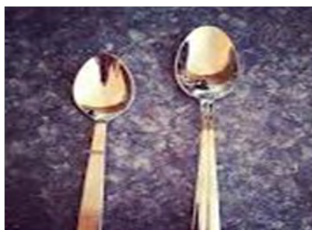
Fig 2: Teaspoon (tsp) & Table spoon (tbsp)