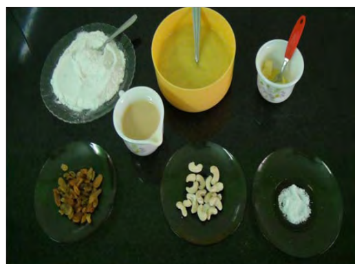
Fig 16: Ingredients for Halwa