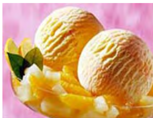
Fig 31: Ice-cream