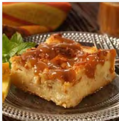
Fig 21: Pudding