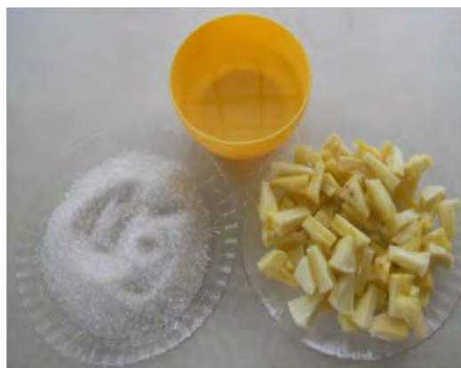
Fig 18: Ingredients for Candy