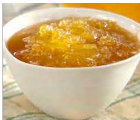
Fig 11: Jam

To test whether the jam is formed, pour some jam on a dry plate. Allow it to cool and tilt the plate. If the jam is ready, it will fall in flakes.