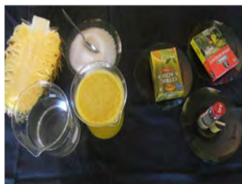
Fig 10: Ingredients for Jam