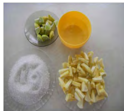
Fig 32: Ingredients for pineapple lime