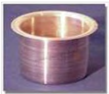
Fig 1: Steel bowl