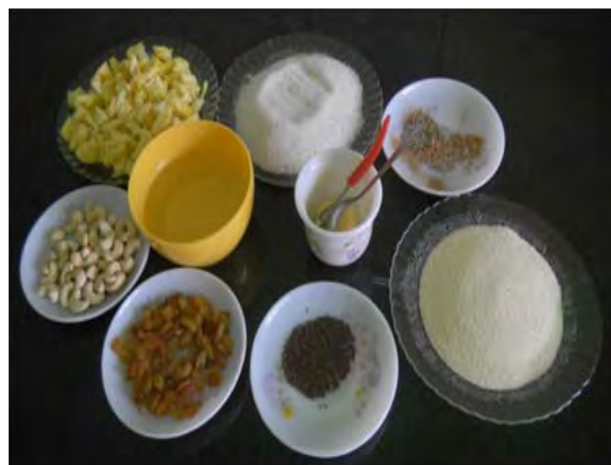
Fig 28: Ingredients for pineapple ball