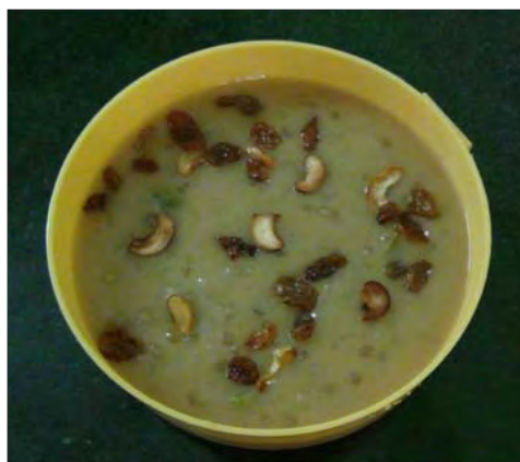
Fig 23: Payasam