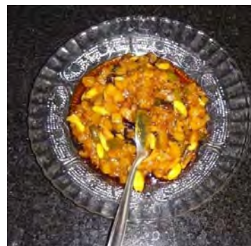
Fig 15: Pickle