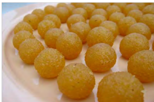
Fig 29: Pineapple ball