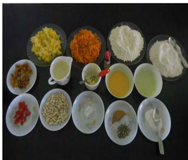
Fig. 26: Ingredients for upside down cake