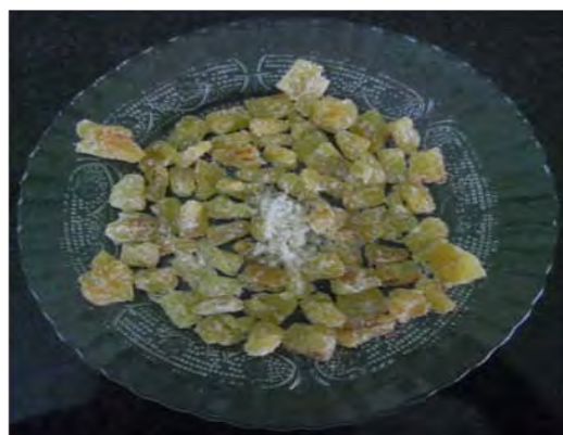
Fig 19: Candy