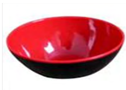
Fig 4: Cup