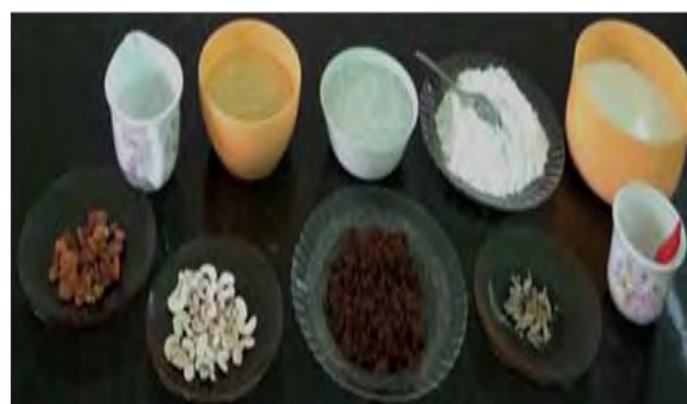
Fig 22: Ingredients for Payasam