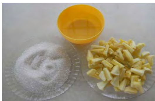
Fig 5: Ingredients for Juice